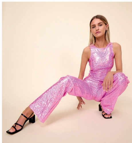
Our pink glitterset in different poses